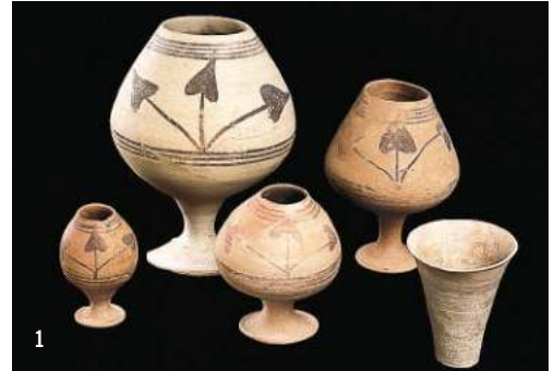
1. Pottery goblets with pipal design, from Mundigak, 3 rd millenium BC, h 9 to 19 cm.

The shapes and floral motives identify this kind of pottery as characteristic of the oldest proto-historic site of Afghanistan. [illus. 1]