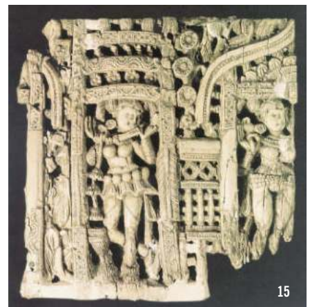
15. Ivory panel from Begram. © Dominique Dubois.