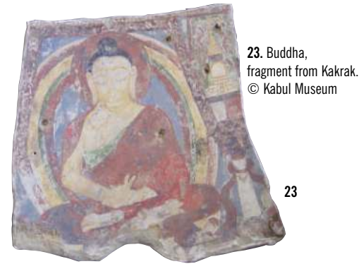
23. Buddha, fragment from Kakrak.

Wall painting fragments have mostly thin pigment in primary colors (red, blue, green, yellow). The figures are usually outlined in black. The paintings have a white base on a ground of clay mixed with small stones and vegetal matter. Subjects vary but are often Buddha figures. [illus. 23]