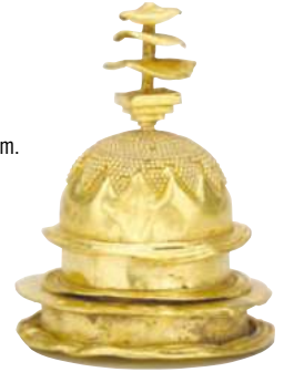
9. Gold stupa-shaped reliquary, 1 st century, ht. ca. 4 cm.

Containers, most often in the form of pellet-shaped boxes with lids or miniature stupas. Usually made from stone (often steatite) though many are made of bronze or precious metals (gold or silver). Size: 2 to 50 cm high. [illus. 9]