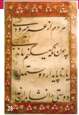
28. Page of a manuscript, ca. 18 th century.

Islamic paper manuscripts are found singly or sewed together as books. They contain ornamental calligraphy usually in Persian but also Arabic, the pages are often decorated with floral designs in various colors and gilding. Occasionally there are illustrations in full color or drawings of single figures, rarely also portraits in black ink. [illus. 28]