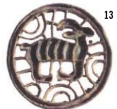
12, 13. Copper compartmented seals, Bactria, 3 rd /2 nd millennia BC.