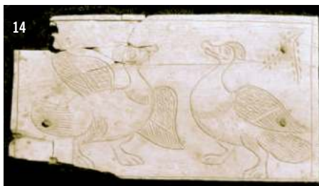
14. Ivory decorative element from Begram.

Ivory panels with carved decoration. Originally affixed as decoration to wooden luxury goods such as a jewel box. [illus. 14, 15]